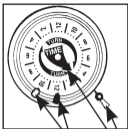
(C) TRIPPERS (B) TIME-OF-DAY MARKER (A) MANUAL KNOB

PROGRAM REPEATS EVERY 24 HOURS TO SET TIMER: (SEE ILLUSTRATION)